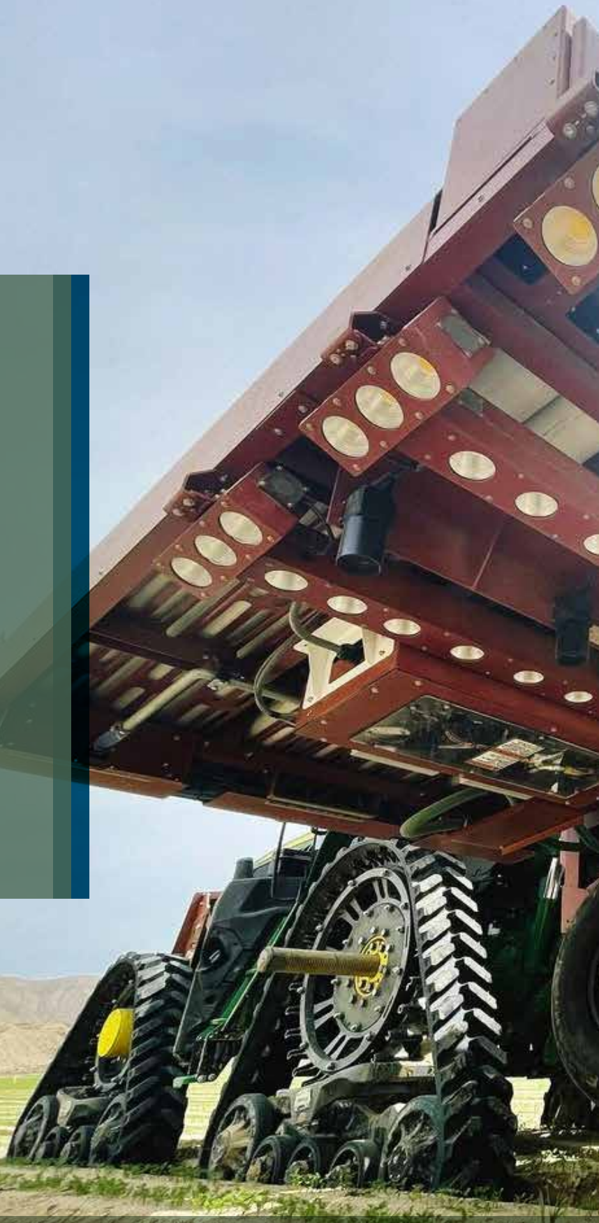
FIGURE OUT THE FINANCIALS FOR YOUR FARM

In this case study, we'll look at how laser weeding impacted both operations, and the annual savings the farms will realize after a 5-year depreciation schedule, if they continue operating the LaserWeeder on the same crops and acreage.